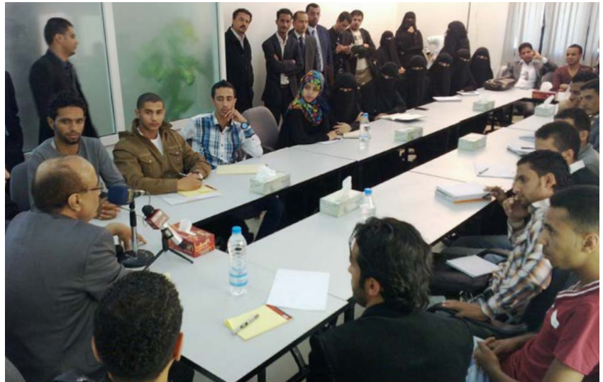
Students taking a course at the MBI Al Jaber Media Institute